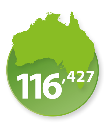
Number of Australians currently homeless

While they make up 12% of homeless figures, people over 55 make up only 7% of clients accessing specialist homelessness services.