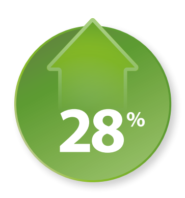
5-year increase in homelessness for people 55 and older