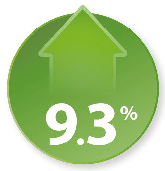
10-year increase of low-income earners in rental stress