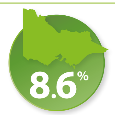
% of Melbourne rentals affordable for people on Centrelink

Low-income earners are feeling the pinch in greater numbers. In capital cities, 47.8% of them report experiencing rental stress.