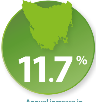
Annual increase in Tasmanian median rent as at 31 March 2020